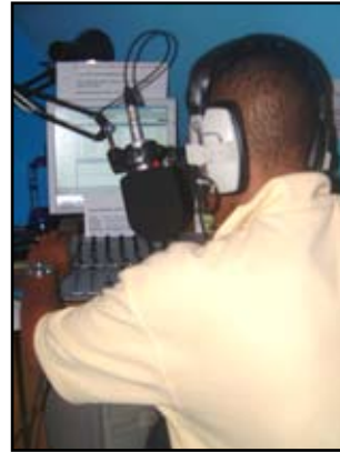
A young trainee producing our radio show

write to us: Community Media, c/o NNREC, North Wing County Hall, Martineau Lane, Norwich NR1 2DH