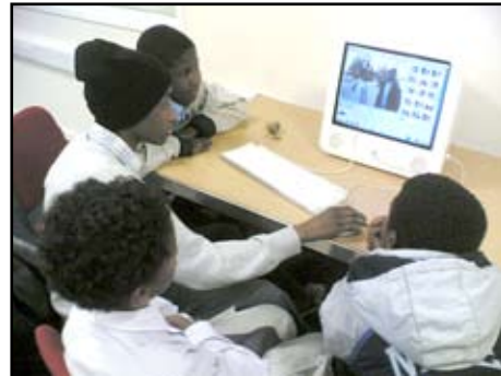
A group of young trainees editing a promotional video